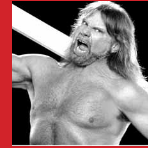
Jim "Hacksaw" Duggan